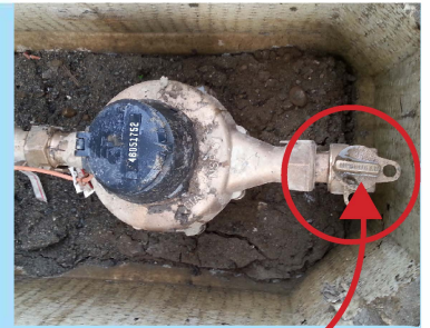
Meter shut-off valve, customer-side: valve is in "ON" position when in line with meter