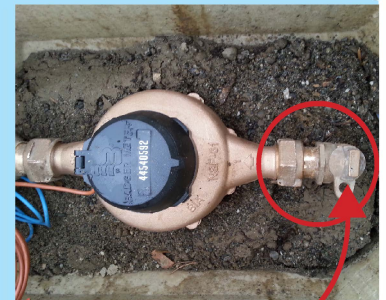
Valve is "OFF" when perpendicular to meter