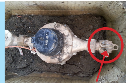
Meter shut-off valve, customer-side: valve is in "ON" position when in line with meter