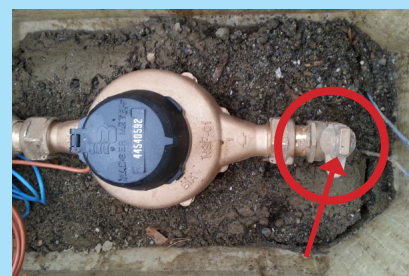
Valve is "OFF" when in vertical position (perpendicular to meter)