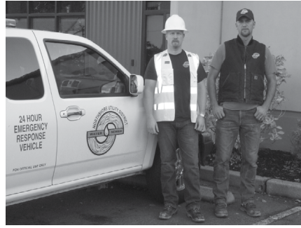
District Staff in Uniform

We rely on you, our neighbors, to report any suspicious activities. Our 24-hour phone number is (425) 398-4400. Your cooperation is greatly appreciated! ♦