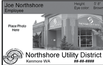
Standard NUD Employee I.D.