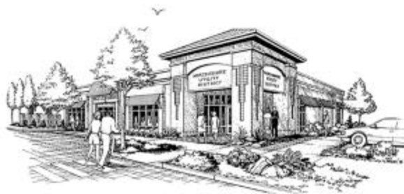
Northshore Utility District Facility

Website: www.epa.gov/safewater Phone #: 1-800-426-4791 e-mail: hotline-sdwa@epamail.epa.gov