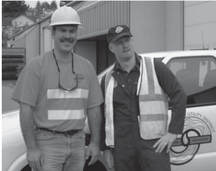
NUD District Staff display samples of the uniform

The May 6, 2005, headline reads: "PSE Impersonator On The Prowl." A man posing as a contractor for Puget Sound Energy might be trying to talk his way into Seattle-area homes. The man claimed to be a contractor with Puget Sound Energy and requested access inside the property of a Queen Ann Hill home to check for a gas leak. The suspicious homeowner called PSE and was quickly told that the man was not one of their workers.